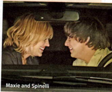
Maxie and Spinelli